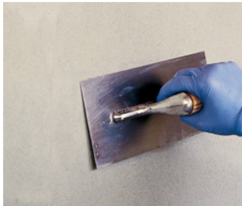
Smoothing Planitop 560 surface with a metal trowel